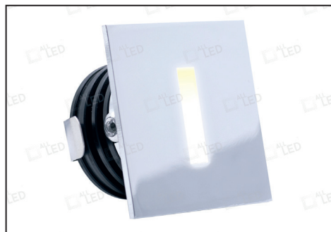
Polished Chrome ALSQ032SC/PC