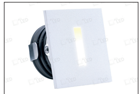
Polar White ALSQ032SC/WH