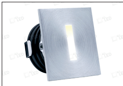
Brushed Aluminium ALSQ032SC/AL