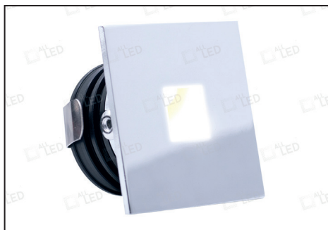
Polished Chrome ALSQ032OP/PC