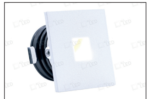
Polar White ALSQ032OP/WH