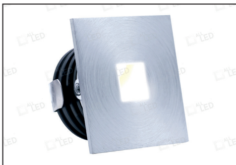
Brushed Aluminium ALSQ032OP/AL