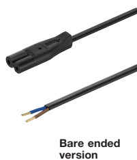
Bare ended version