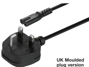
UK Moulded plug version