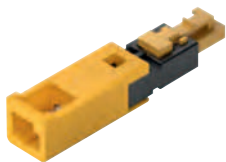
12V: Loox5 socket/Loox plug