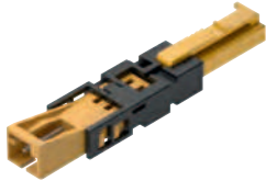
12V: Loox socket/Loox5 plug