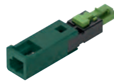
24V: Loox5 socket/Loox plug