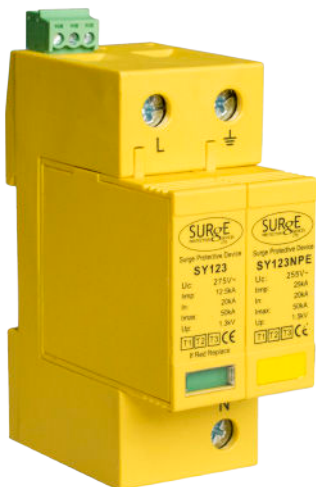
Part No. SY123/25KA2P

Fully Compliant to BSEN62305, BS61643-11 & BS7671 Cost-Effective Combined Lightning and Surge Arrester